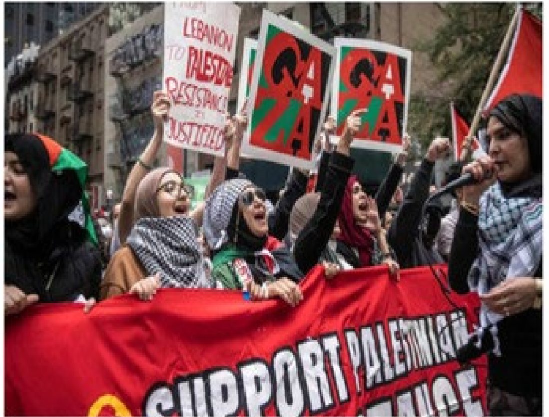
Pro-Palestinian demonstrators marched toward the United Nations on Monday. A pro-Palestinian rally on Sunday led to fierce political backlash.