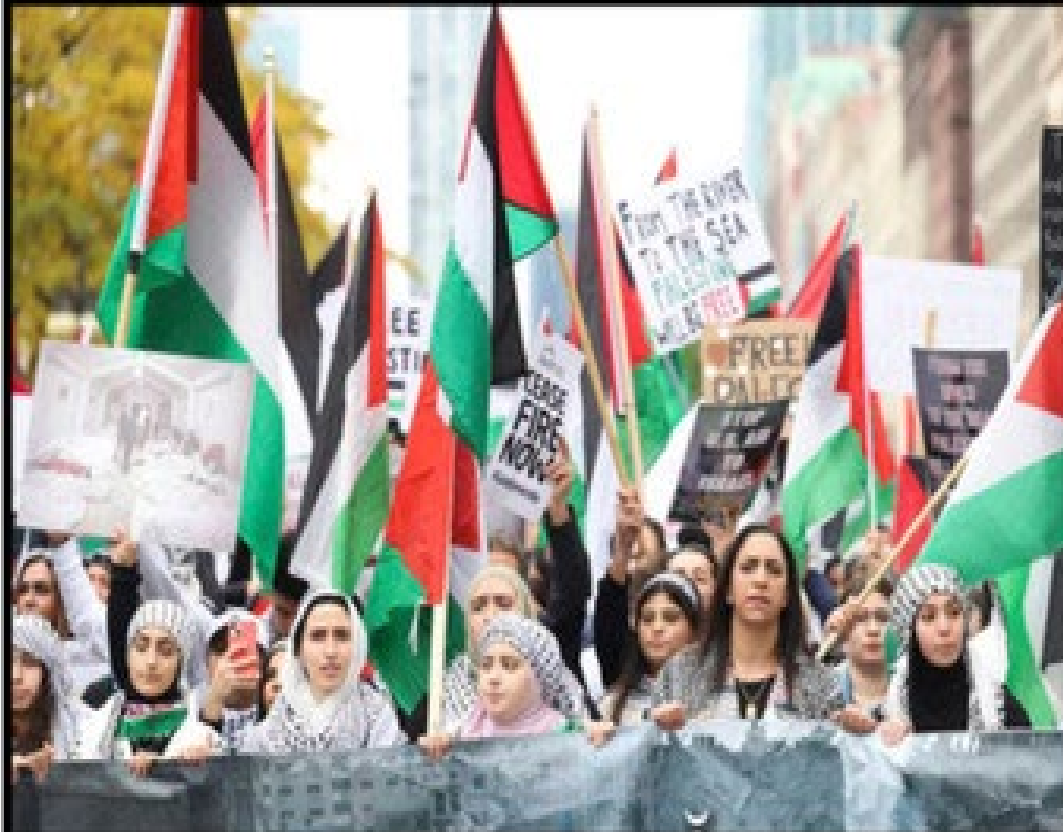
A pro-Palestine protest moves north on Michigan Ave. on Oct. 21, 2023.