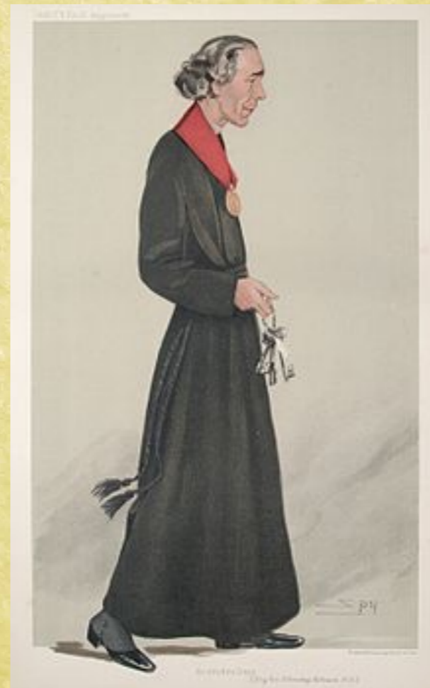
“An erudite Dean” As depicted by “Spy” (Leslie Ward) in Vanity Fair , December 1905