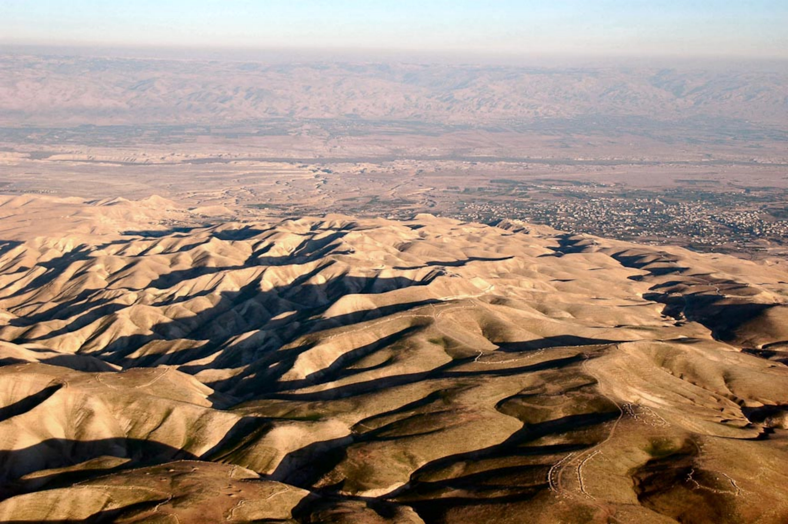
Jericho area aerial from west