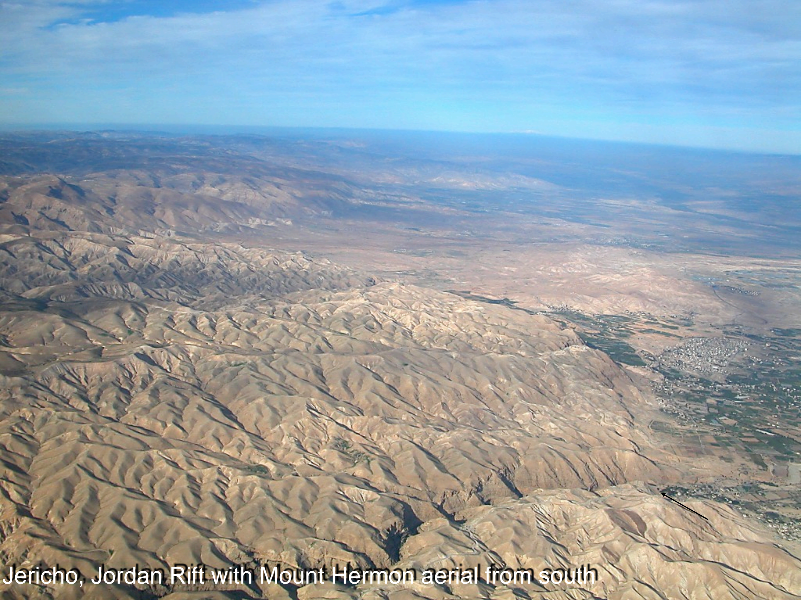
Jericho, Jordan Rift with Mount Hermon aerial from south