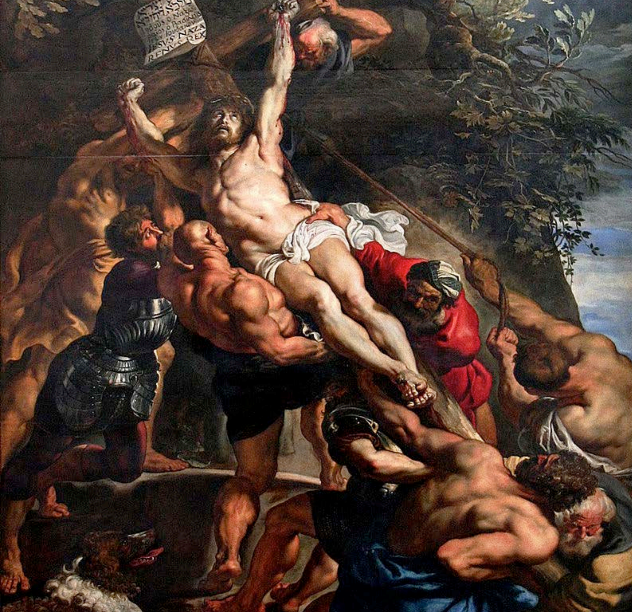
Peter Paul Rubens The Elevation of the Cross (1610–11)