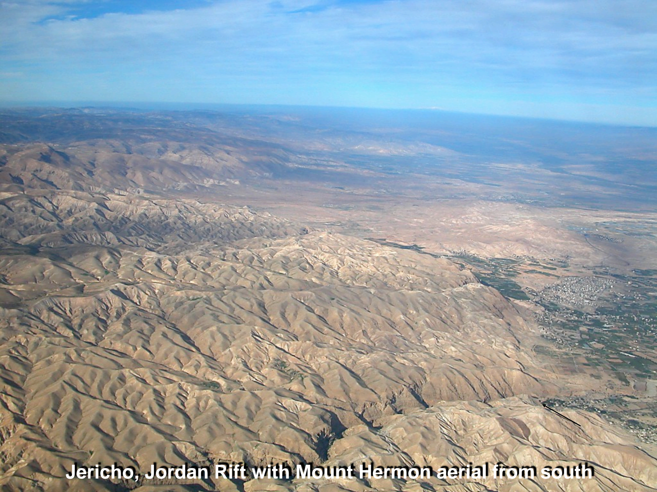
Jericho, Jordan Rift with Mount Hermon aerial from south