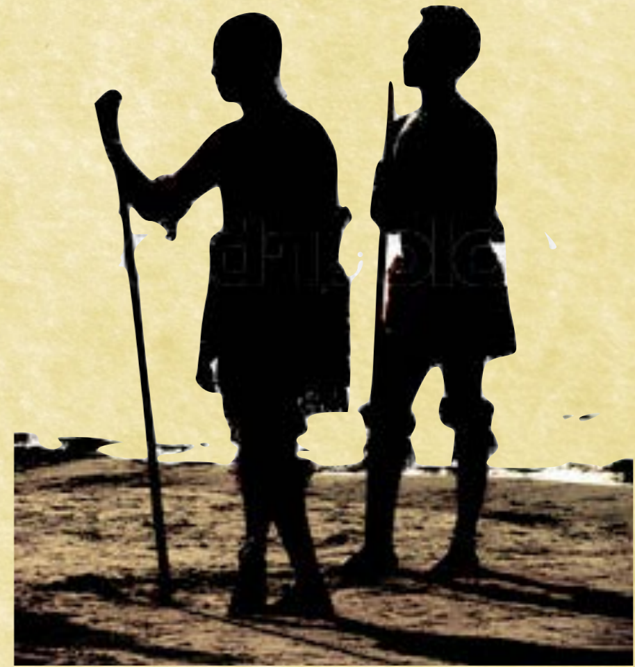
Pagan aborigines; Your neighbor

God the Holy Spirit convincing them of the truth