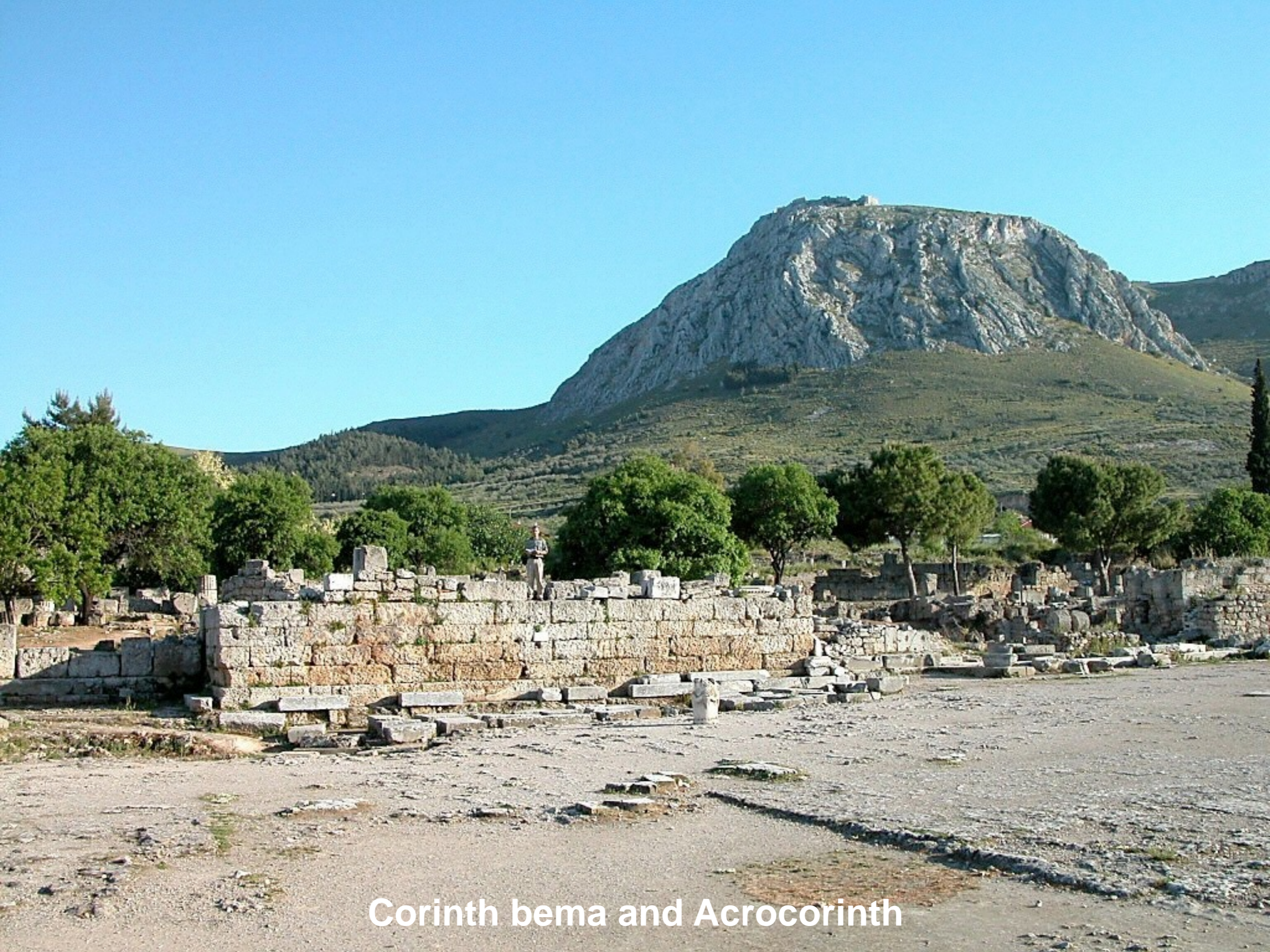
Corinth bema and Acrocorinth