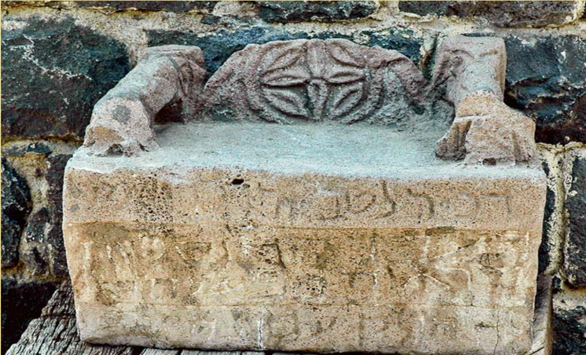
The Seat of Moses at the Synagogue of Chorazin

Matt. 23:1 , “Then Jesus spoke to the multitudes and to His disciples, Matt. 23:2 , “saying: ‘The scribes and the Pharisees sit in Moses’ seat.’ ”