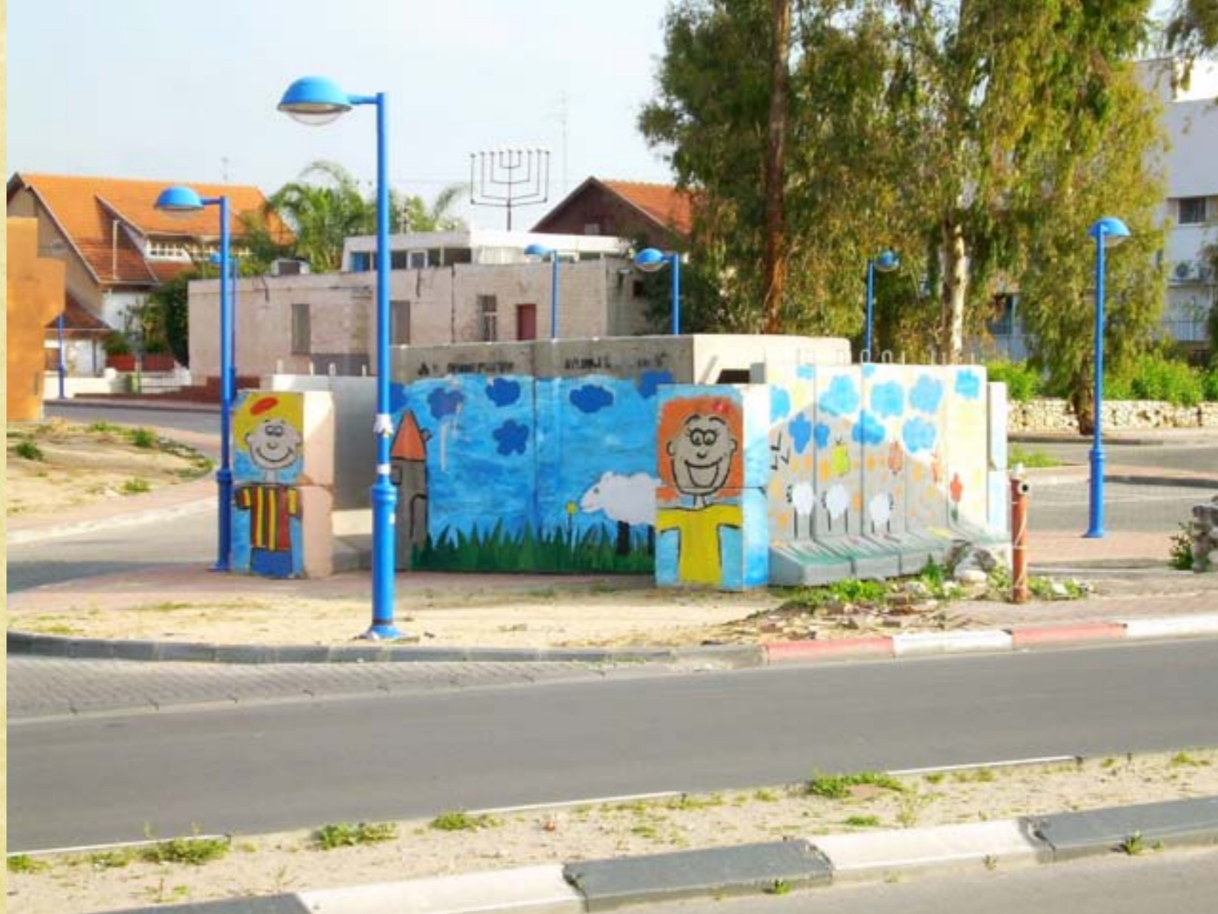
Sderot bomb shelter