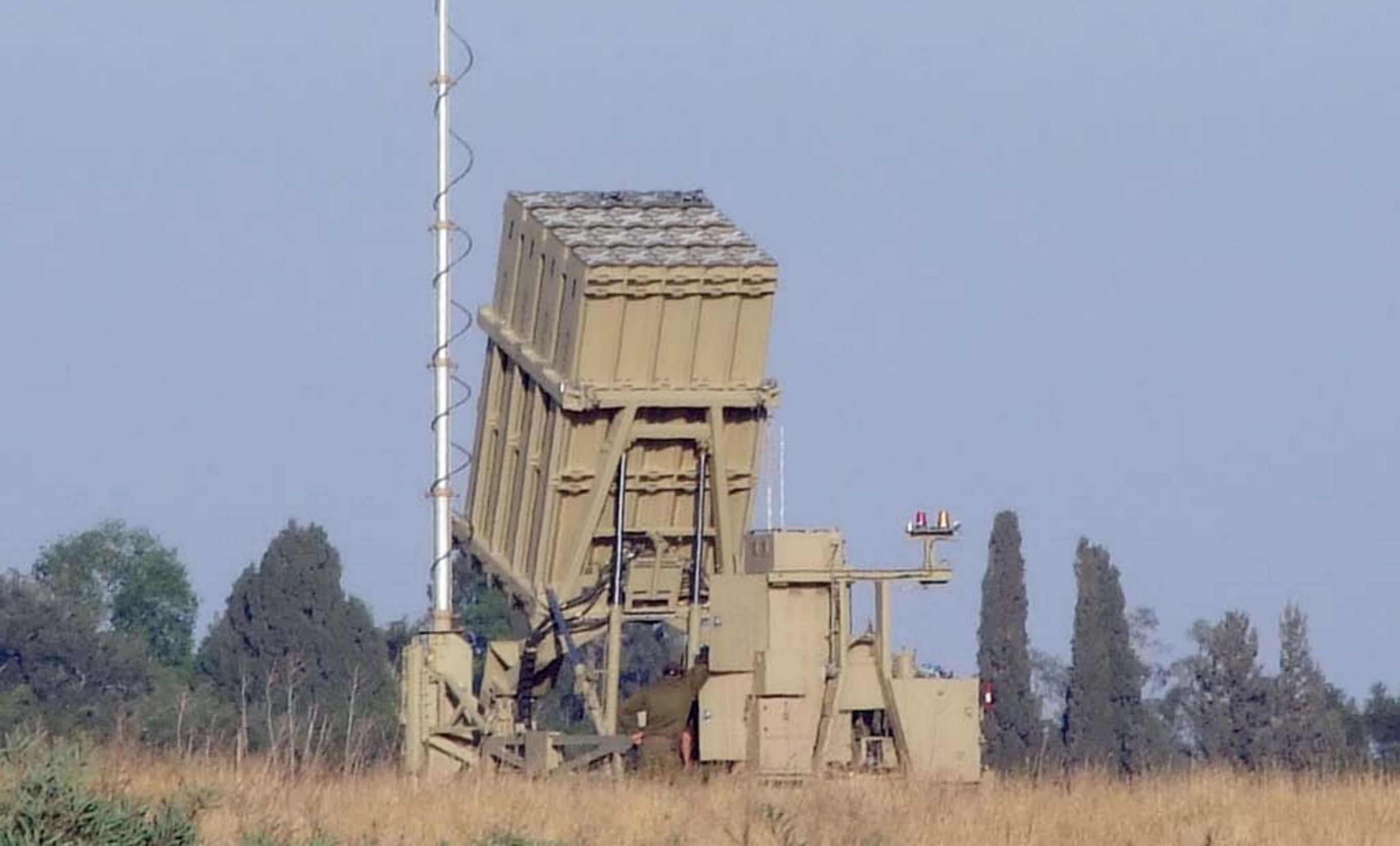
Iron Dome Defense Shield