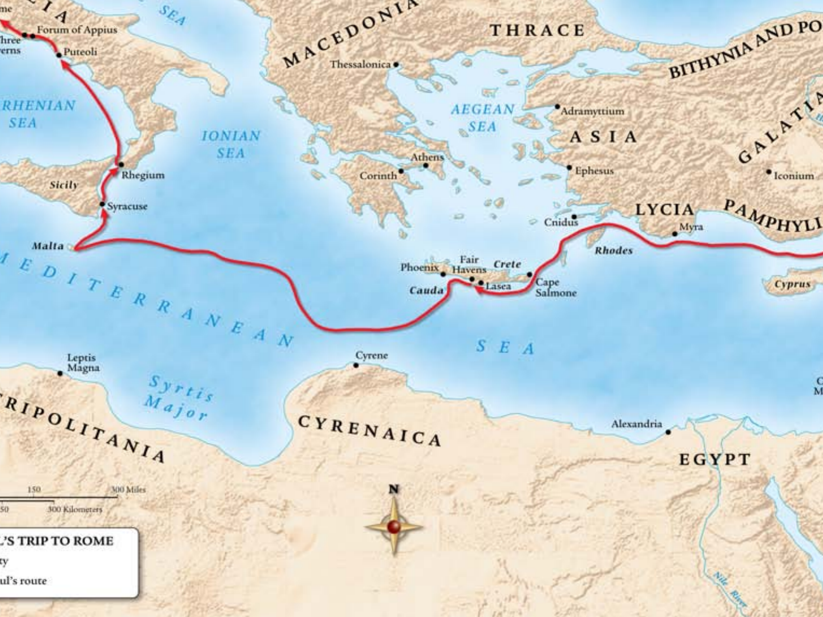
SCIPIO AFRICANUS'S TRIP TO ROME Scipio Africanus's route