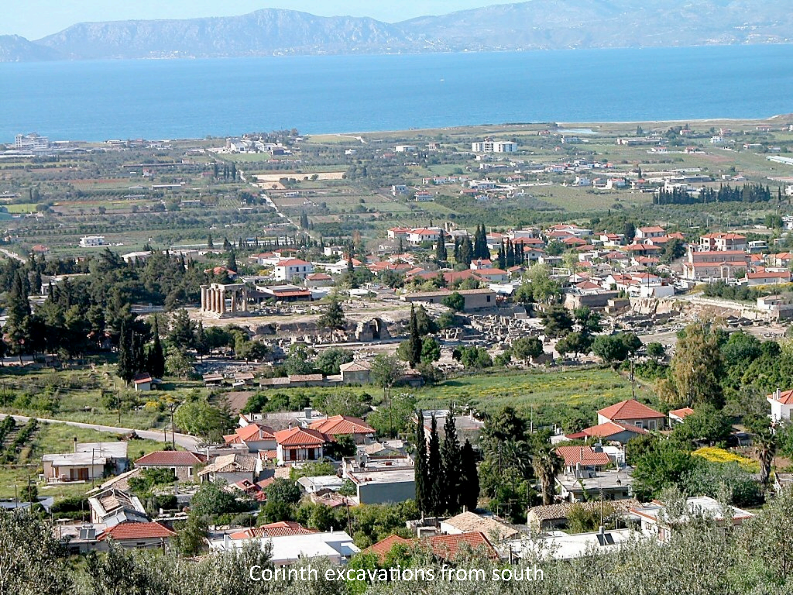
Corinth excavations from south