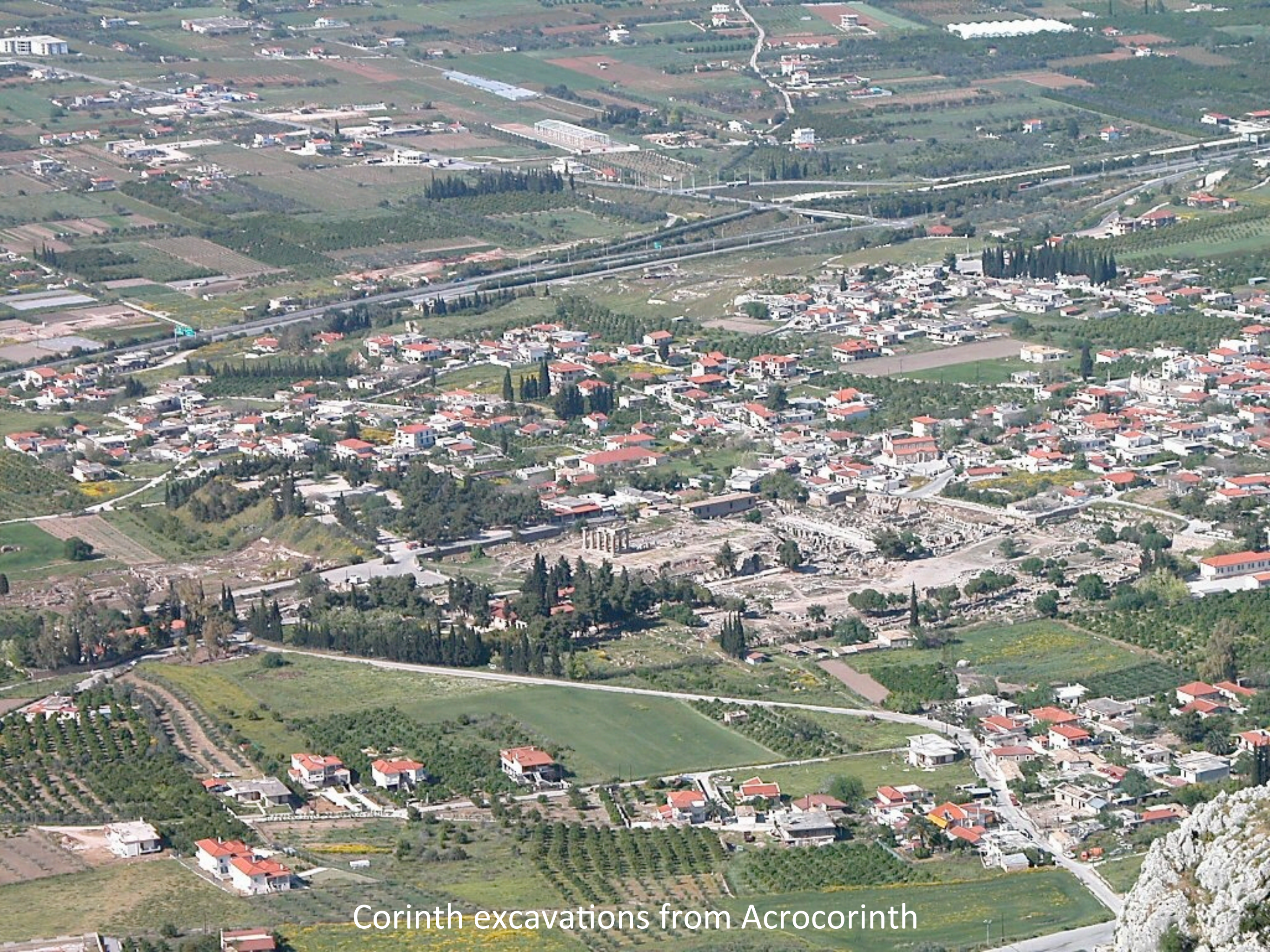
Corinth excavations from Acrocorinth