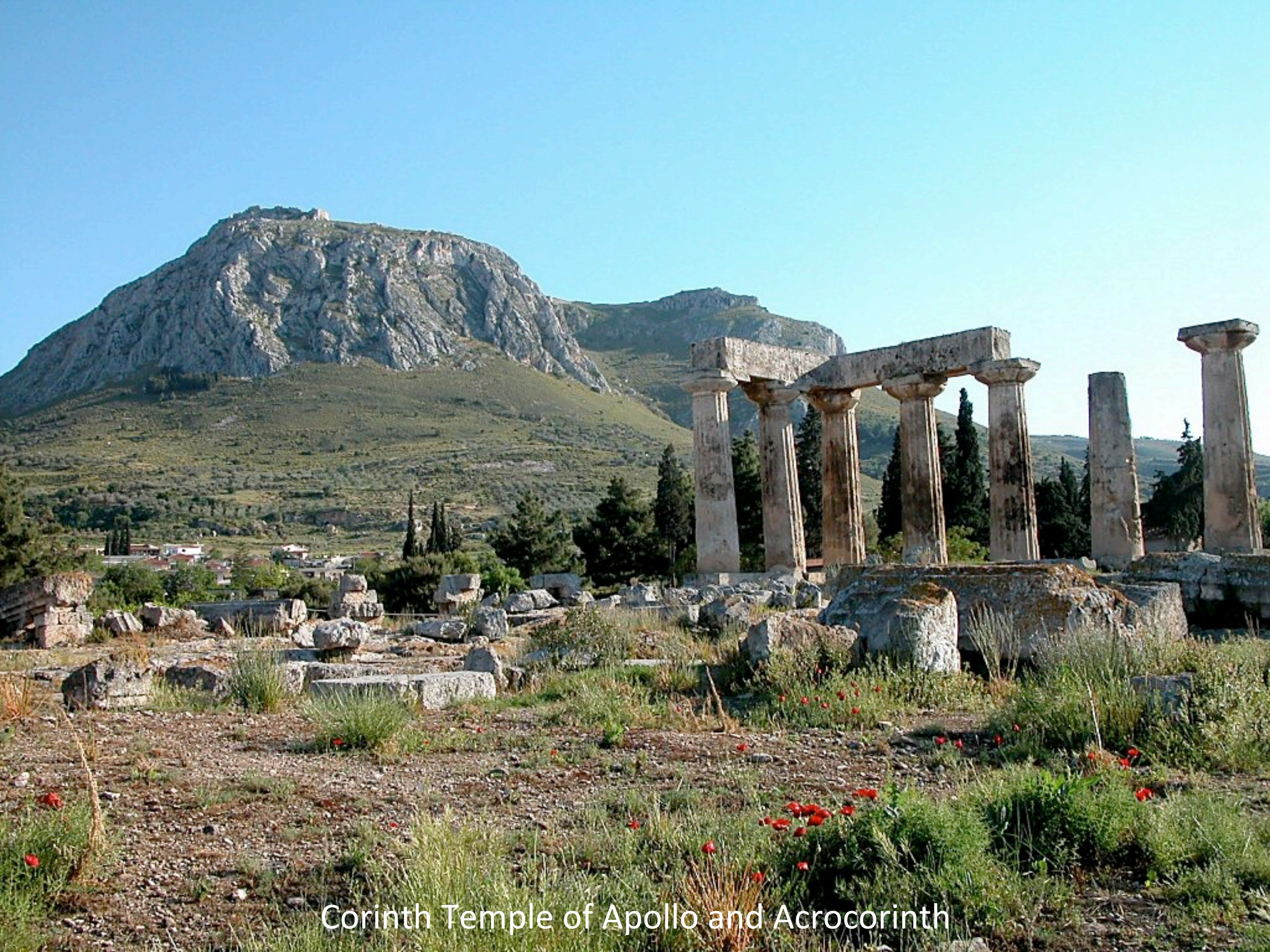
Corinth Temple of Apollo and Acrocorinth