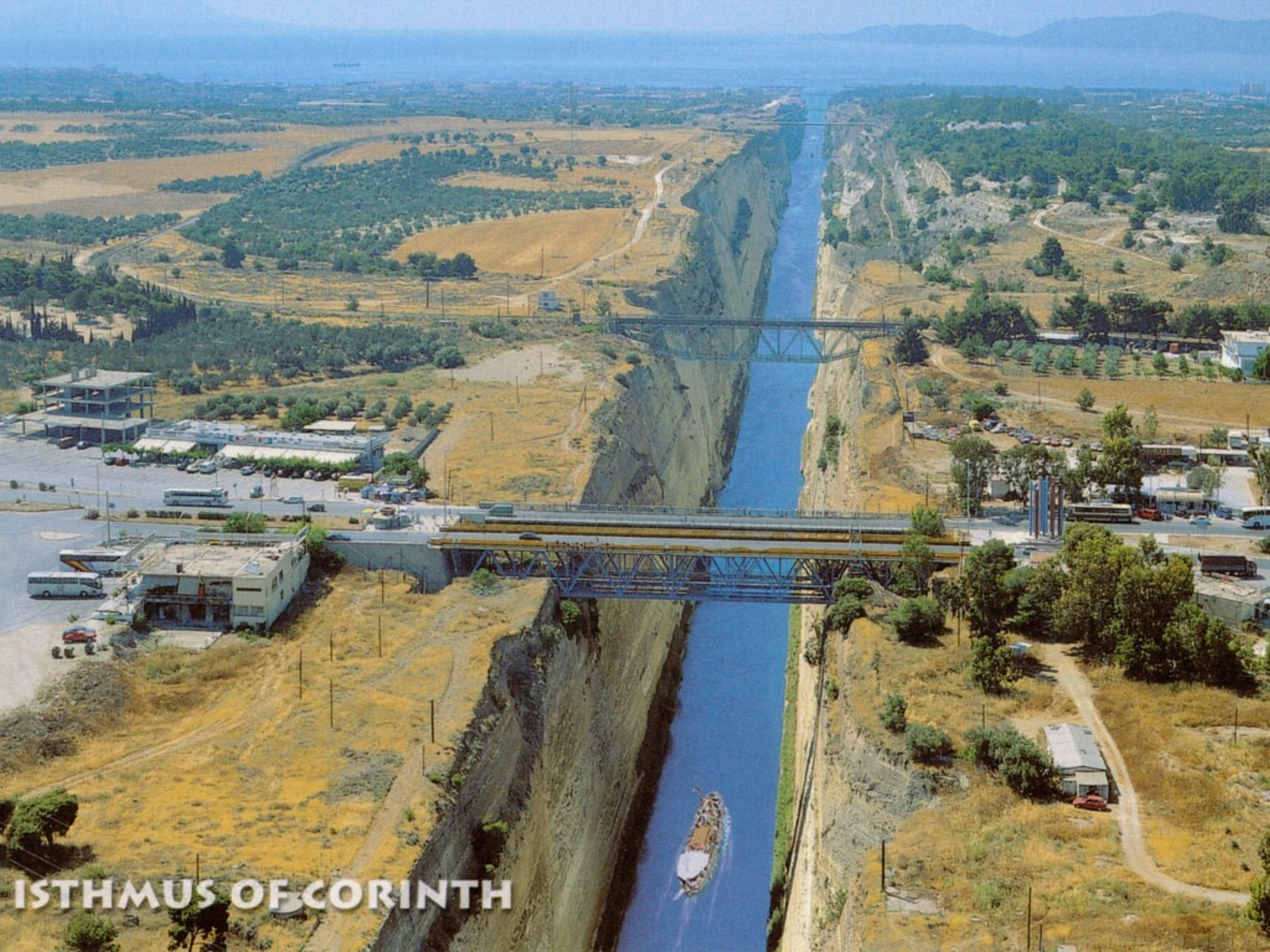
ISTHMUS OF CORINTH