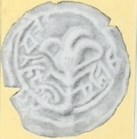
Coins of the Hasmoneans