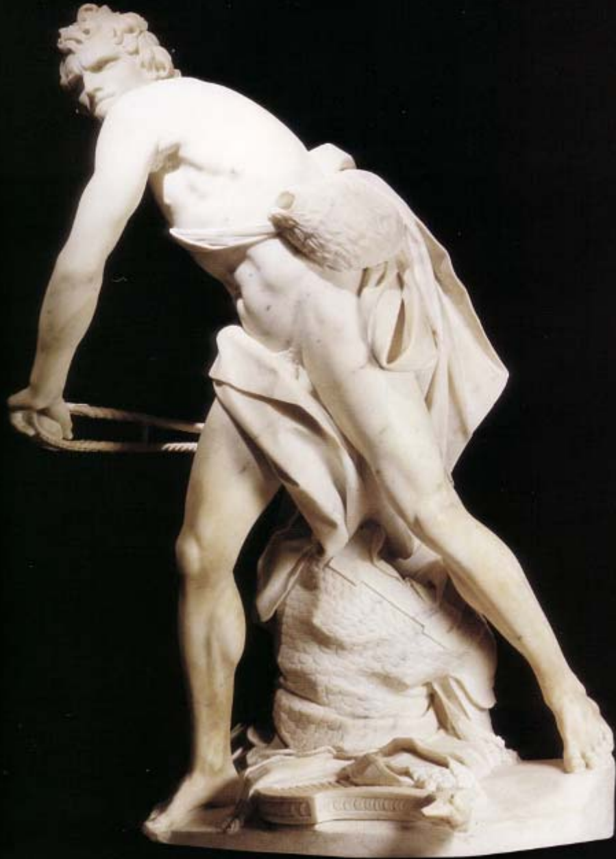
Bernini, David 1623-24 White marble 170 cm Galleria Borghese, Rome